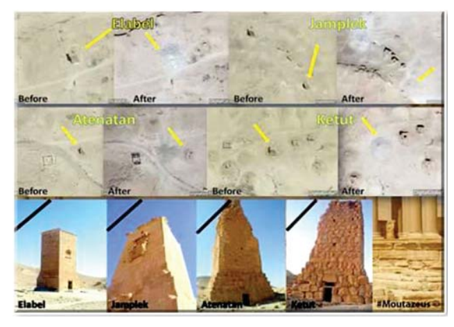
Fig. 2. Aerial photographs of the Tomb Towers published by Boston University Рис. 2. Аэрофотоснимки башен Гробниц, опубликованные Бостонским университетом

Palmyra lost its significance as one of the main cities of the Levant countries when its rulers moved to Baghdad. Thus, it remained unknown up until the time when a contract was signed between Ayubs and Mamlukes (Al-Bakri. 1992. p. 177) when it became famous due to the new military fortifications, such as a citadel, and the Bel's temple turned into a fortified village protecting the state against crusader attacks (Al-Bunni A., Al-Assad, Kh. 2003. p. 93.).