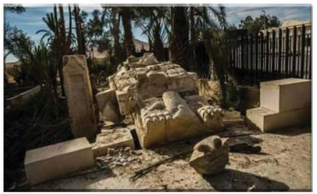
2016 Fig. 8. Statue of Assad Allat after the war and view before 2010 Рис.8. Статуя Асада Аллата после войны и вид до 2010 г.

remained until today (Mikhalovski, K. 1961–1962, p. 155–161.).