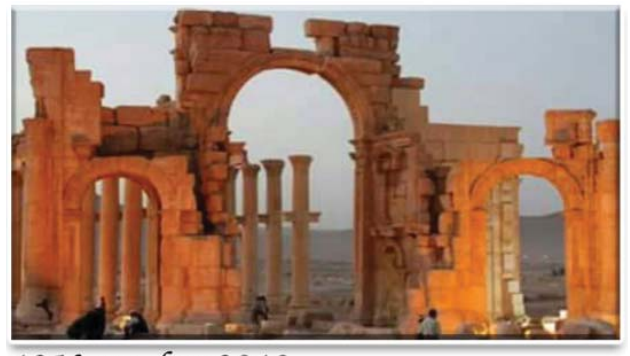
12November 2010