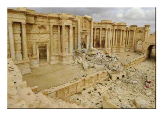
Fig. 5. Ruined roman theater Рис. 5. Разрушенный римский театр

3 – Grave houses. This type of tombs appeared and was widespread also in the first century AD. As a rule, the building consists of one floor and has a beautiful entrance. The door is a stone monolith with plentiful quantity of the cut-out patterns. The building features an open yard surrounded with a covered yard with columns supporting the roof. Along the internal perimeter, there are steps, on which crypts and graves are constructed. Opposite, there is a sculptural group of a funeral procession in the form of figures of