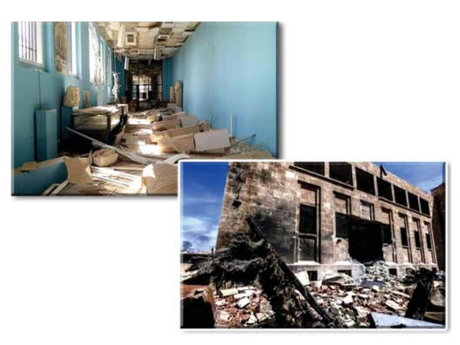
Fig. 7. Destructions in the National Museum of Palmira Рис. 7. Разрушения в Национальном музее Пальмиры

This street starts from the main entrance to the Bel's temple and reaches the gate of Damascus, and four parts of this street can be allocated, limited to the main architectural sites: