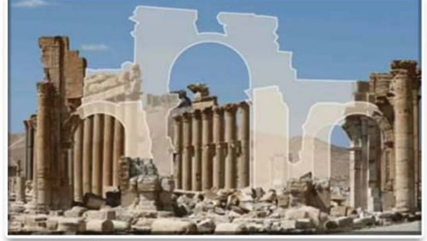
31 March 2016 Fig. 6. Arch of Victory preserved after the war and view until 2010 Рис. 6. Арка Победы. После войны и вид до 2010 г.

the tomb's owner and the members of his family (Kolinye, A.Sch. 2005. P. 94.). In Palmyra, there are several grave houses, including Ailimi bin Zubeyda's tomb, and another grave house known as the White Palace (Kasr Al-Abyad) not far from Elakhbela tower. In addition to these tombs which were widespread in Palmyra in their various embodiments, there were also isolated sepulchral burials, among which is grave G discovered at an excavation by the Japanese group of researchers in east portion of the tombs in 2001. At the same time, the sizes of each separate isolated grave were in most cases 2.5 \times 1 m. The internal area of the grave was decorated with stone bas-reliefs with cut-out ornaments. Deceased I was located in an earth grave in a coffin made from clay or wood, and over a grave was a plate decorated with a carved ornament, which ended on the top with a pyramid or a semicircle. The plate featured a figure of the deceased and his name cut out in stone (Al-Bunni, A. 1972. p. 42.).