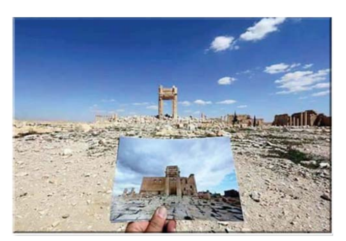
Fig.3. Destruction of the Temple of Bel Рис. 3. Разрушение храма Бела

1 – Bel's temple: Its construction is attributed to the first century AD, and it is generally dedicated to god Bel, and also a triad which include god Bel, Yarkhibol (god of the Sun) and Aglibol (god of the Moon). An extensive square yard with a 205-210 meter long fenced section is part of the temple (Abd-Alkhak S. 1996. p. 222-227.). In the center of the yard there is a temple with idols of the main god and the deities belonging to a triad, where an altar for sacrifices, a banquet room and a house of blessing are located. The temple is surrounded with a fence scalloped steps marking the entrance to the yard (Février, J.G.1931. p.97.2). The temple was turned into a strengthened village in the thirteenth century AD in the period when Salakheddin, Yusef the son of