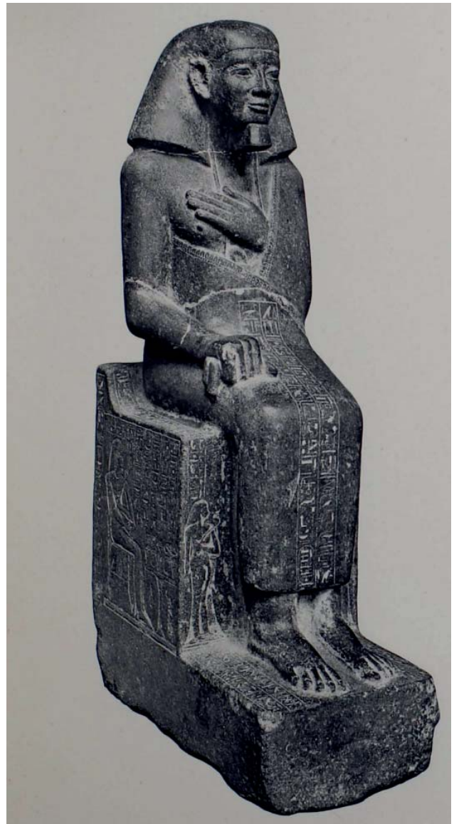
Fig. 5. Sitting human. (Legrain 1914, PL. XIII- 42206).

The tradition of creating double human statues was a characteristic feature of Ancient Egyptian art, and they were mainly made of various types of stone and faience. Most likely, statues of this type were related to a certain religious rite. Since, they are found mostly in temples and grave monuments. It should be noted that during this period art was strongly influenced by religion. These influences further promoted backwardness by suppressing free creativity in painting, sculpture, and architecture (Токарев 1986, с. 318). For the ancient Egyptians, black color indicated grief and this color was given special importance in the funeral process. One of the possible versions is that the black faience statue found in Divalona was intended for burial. It should also be noted that black and blue occupied an important place in the color symbol of the ancient Egyptians, and special attention was paid to these colors during the New Dynasty (Dilek 2022, s. 173-174). Researchers are of the opinion that metal oxides were used in the preparation of various colored faience productions (highly glazed pottery), and