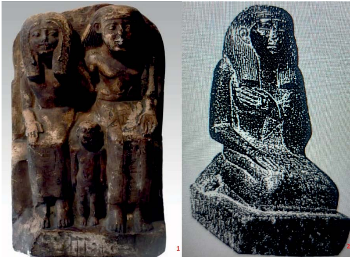
Fig. 3. 1 – Sheri family; 2 – Nurse Satsneferu (Özkan 2017). Рис. 3. 1 – Семья Шери; 2 – Медсестра Сацнеферу (Озкан 2017).