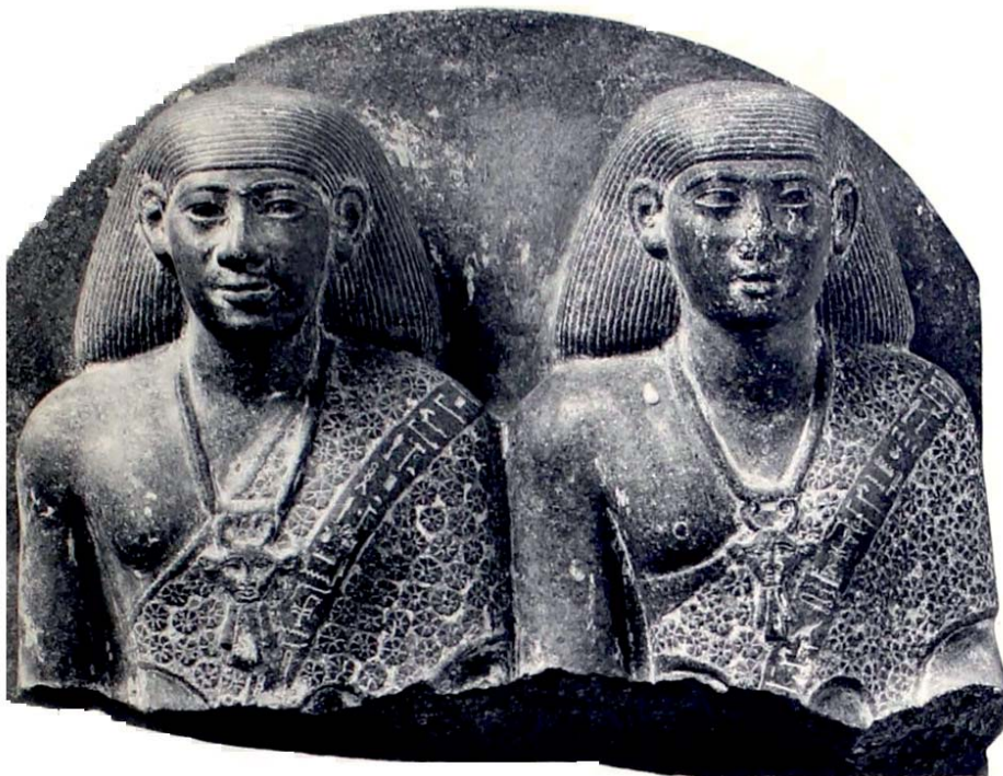
Fig. 4. Man and woman (Legrain 1914, PL.XLVIII-42241).