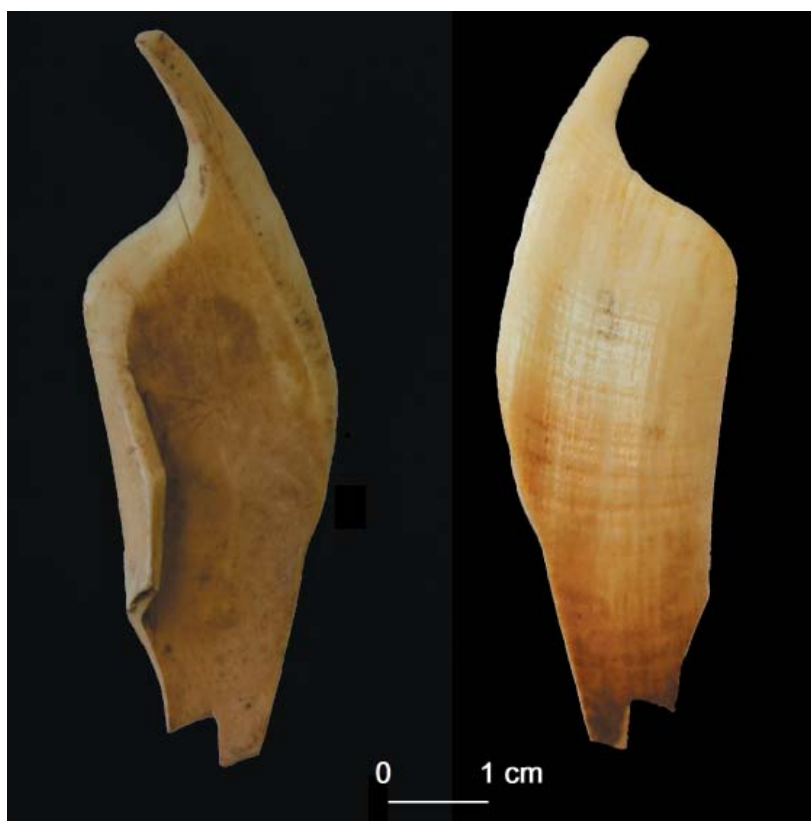
Fig. 1. Example of tool interpreted as "leather knife", recovered on Cuzoul de Gramat site (Lot, France).

Фабрэ Эммануэль , лаборатория трасологии, Университет г. Тулуза им. Ж. Жореса (г. Тулуза, Франция); emmanuelle.fabre@hotmail.fr