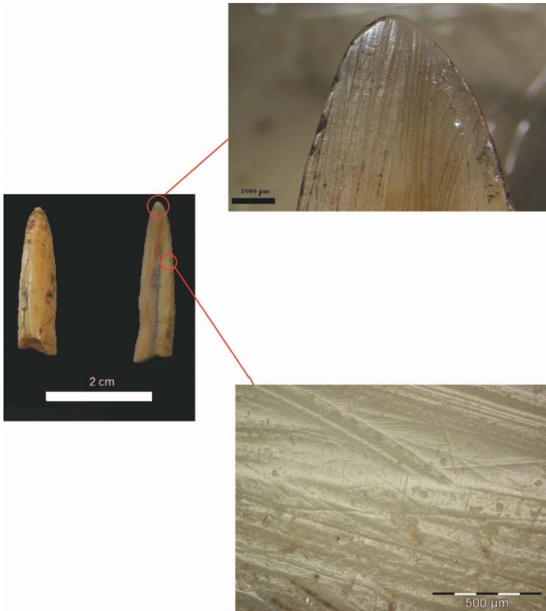
Fig. 6. Tool used for hide worked ( \times 10 and \times 100 ).